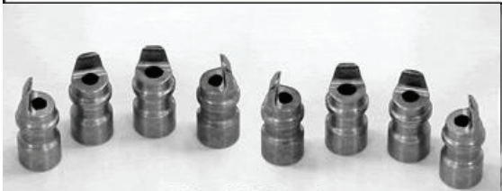
20-1522-1 Spade Sleeve Adaptor

In the mean time, you can still use your Tru Align System by using the "Spade Sleeve Adaptors" (see picture below). Notice how the adaptors go over the outside of the plate and how the plate fits into the outside channel of the Spade Sleeve Adaptor.