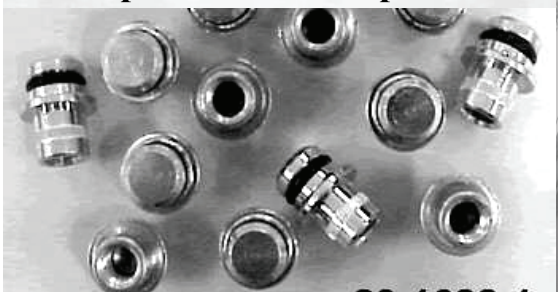
Rim Stud Retainers 20-1688-1

Spade Sleeve Channel Outside Edge of Plate Rim Stud Retainers